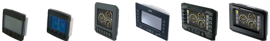
DP200 / DP211