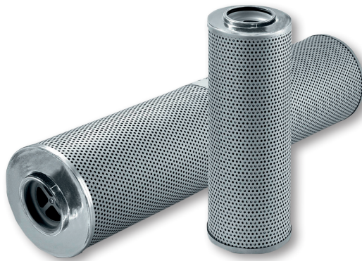
EXAPOR®AQUA Filter Elements