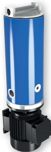
Off-line Filter Unit FNA 008/016